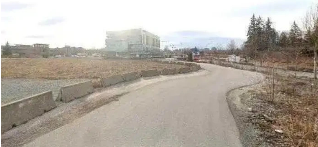
Mnp llp accounting business consulting and tax services street view 360deg