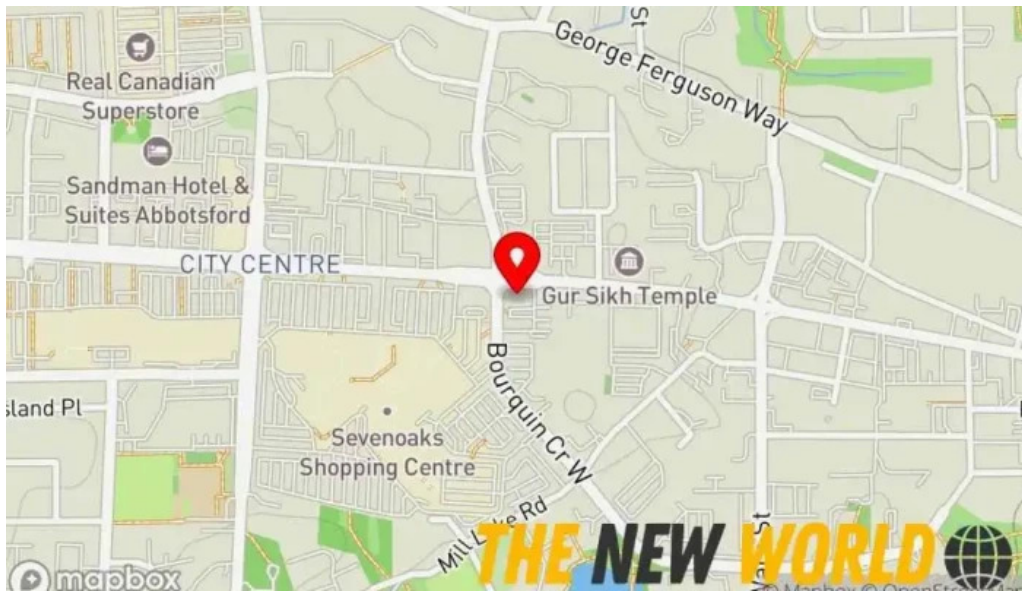
Mnp debt licensed insolvency trustees bankruptcy consumer proposals map