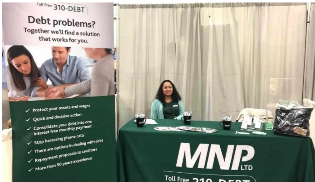
Mnp debt licensed insolvency trustees bankruptcy consumer proposals abbotsford