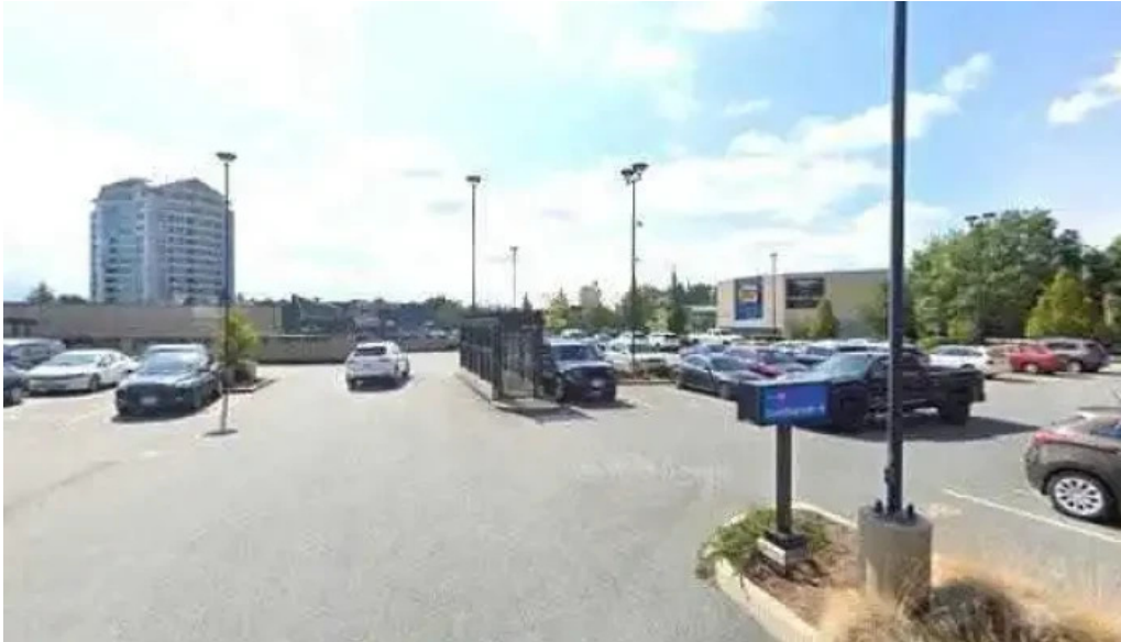
Mnp debt licensed insolvency trustees bankruptcy consumer proposals street view 360