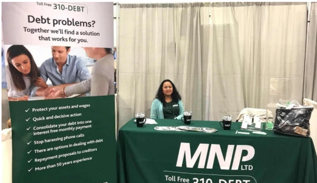
Mnp debt licensed insolvency trustees bankruptcy consumer proposals all