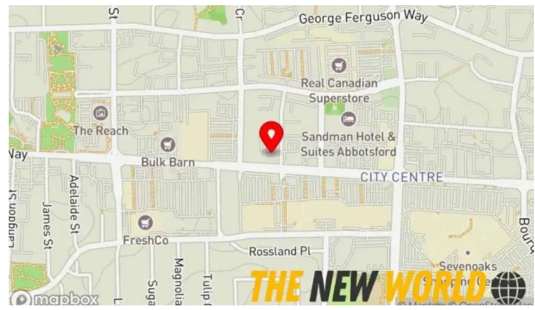
Sands associates consumer proposals debt help licensed insolvency trustees map