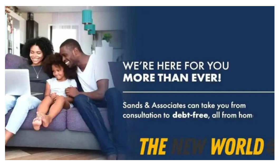
Sands associates consumer proposals debt help licensed insolvency trustees by owner