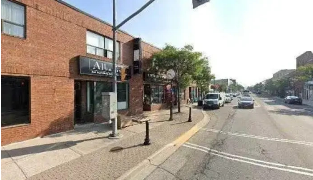
Marino vereecke chartered accountant all