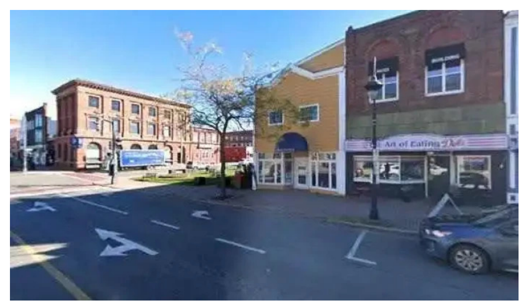
Town of amherst street view 360deg