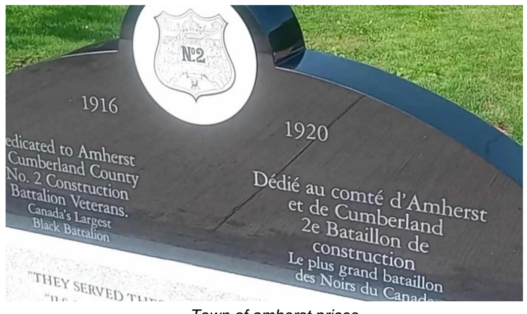
Town of amherst prices