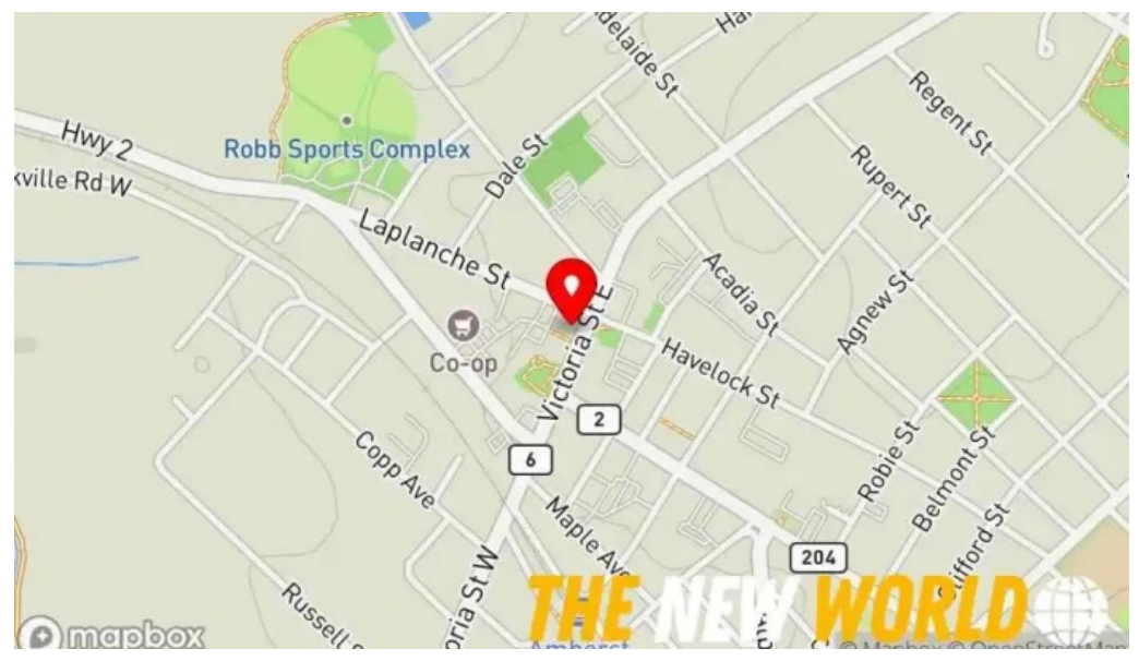
Town of amherst map