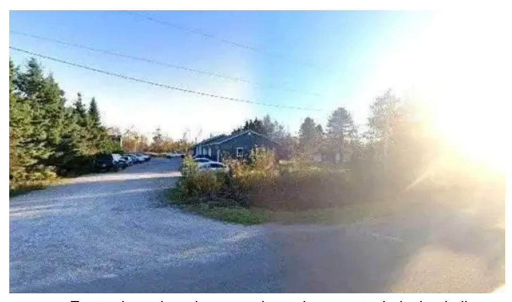
Easttech engineering consultants inc geotechnical pei all

Easttech engineering consultants inc geotechnical pei by owner