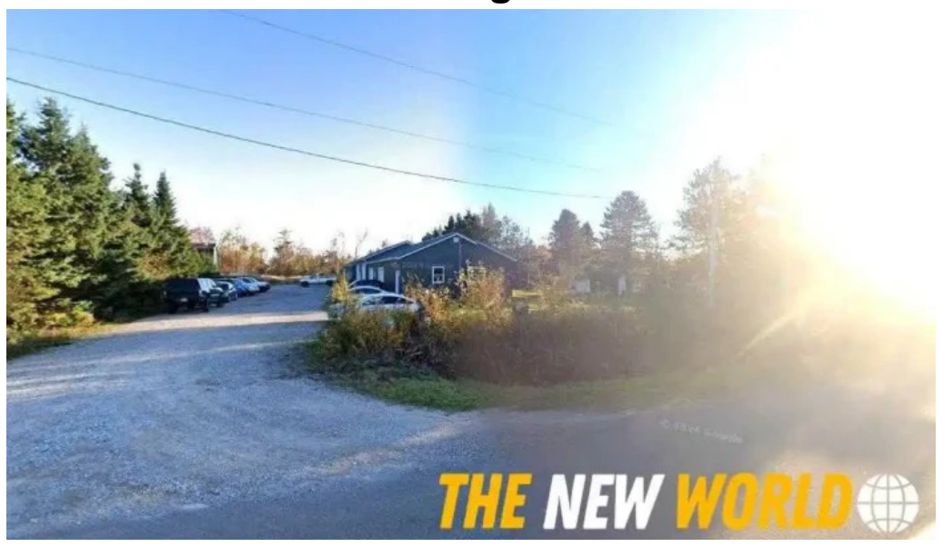
Easttech engineering consultants inc geotechnical pei bethel