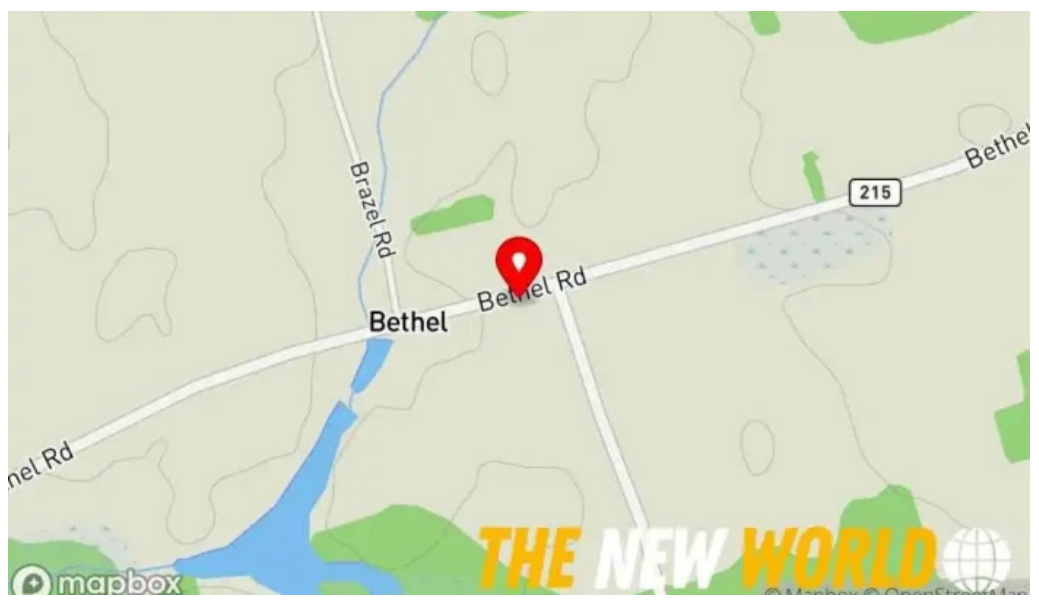
Easttech engineering consultants inc geotechnical pei map