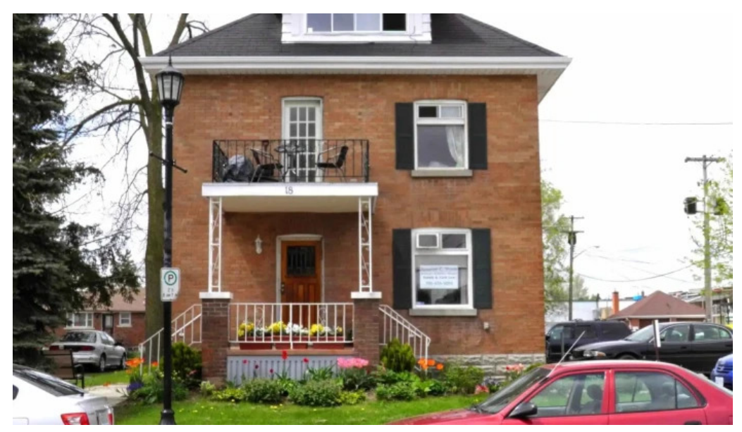
Shank law professional corporation by owner