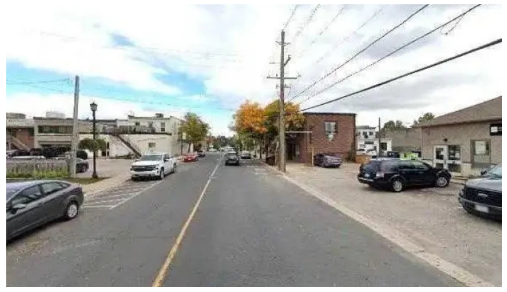
Shank law professional corporation street view 360deg