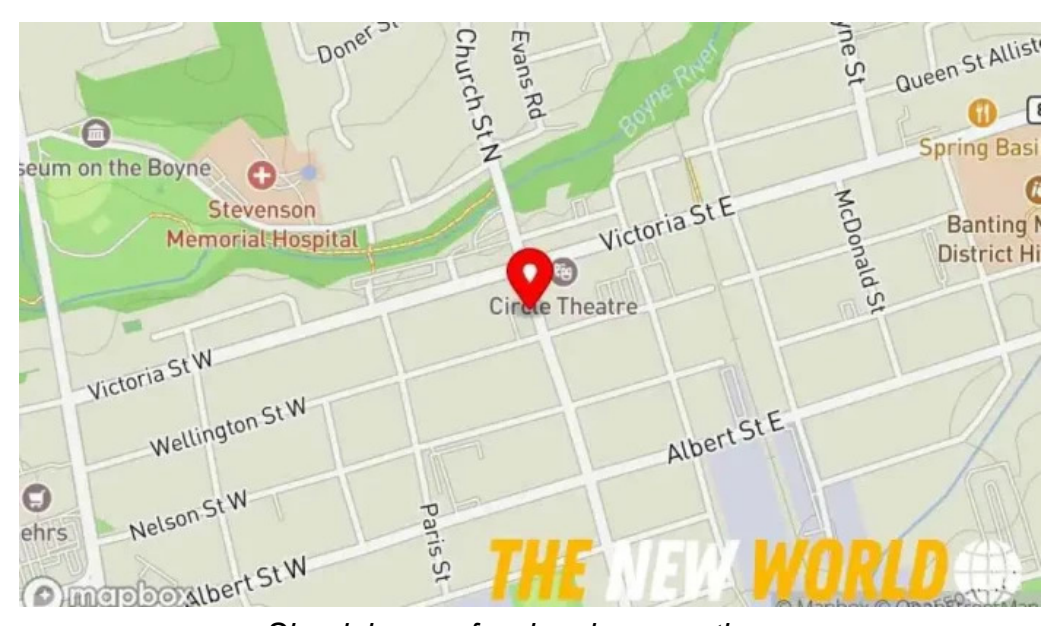
Shank law professional corporation map