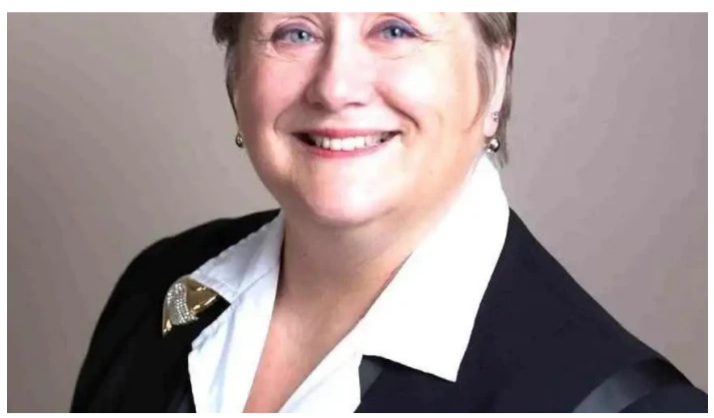
Shank law professional corporation alliston