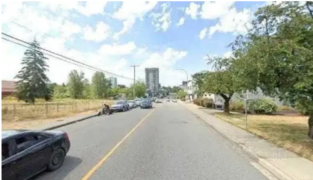
Bdc business development bank of canada all