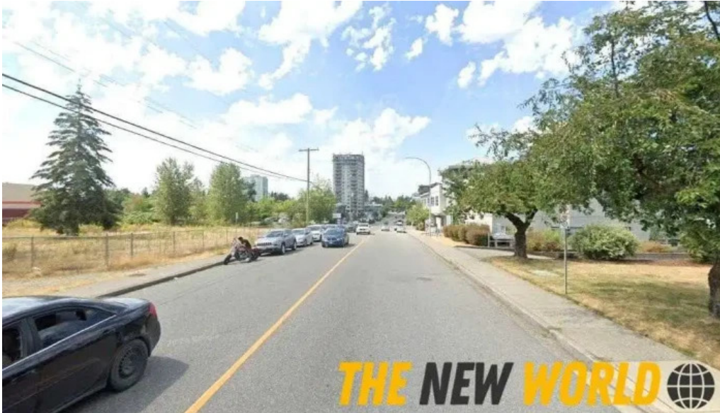
Bdc business development bank of canada abbotsford