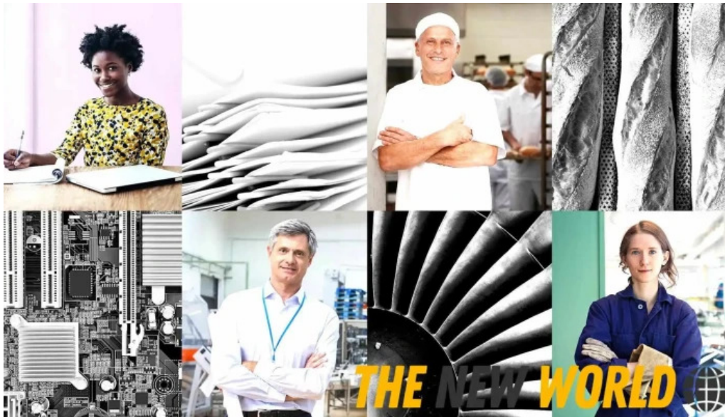
Bdc business development bank of canada by owner