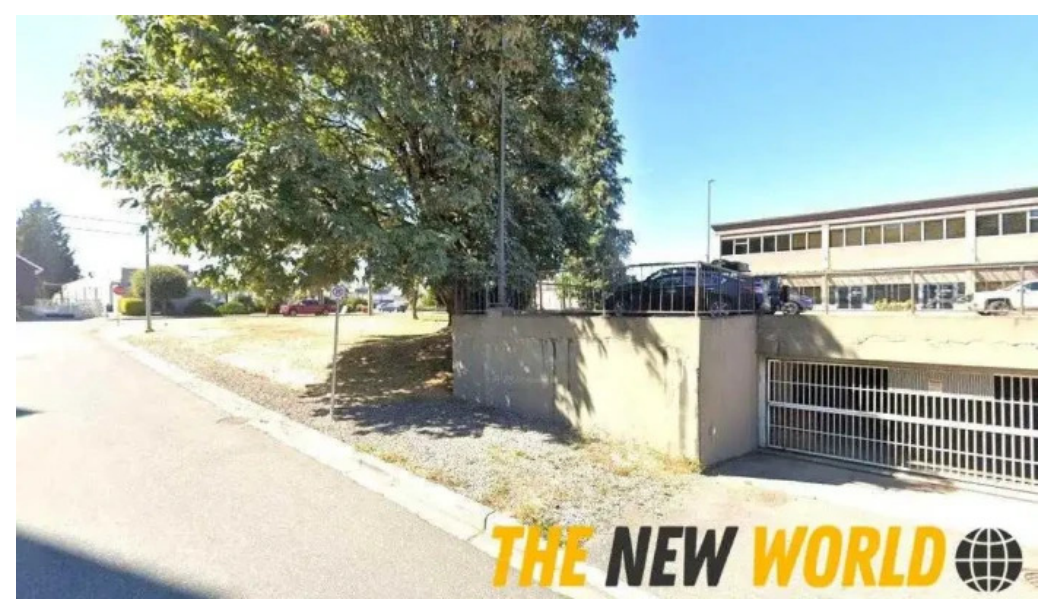
Assante capital management ltd abbotsford