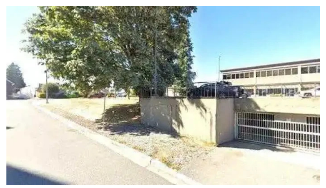
Assante capital management ltd all