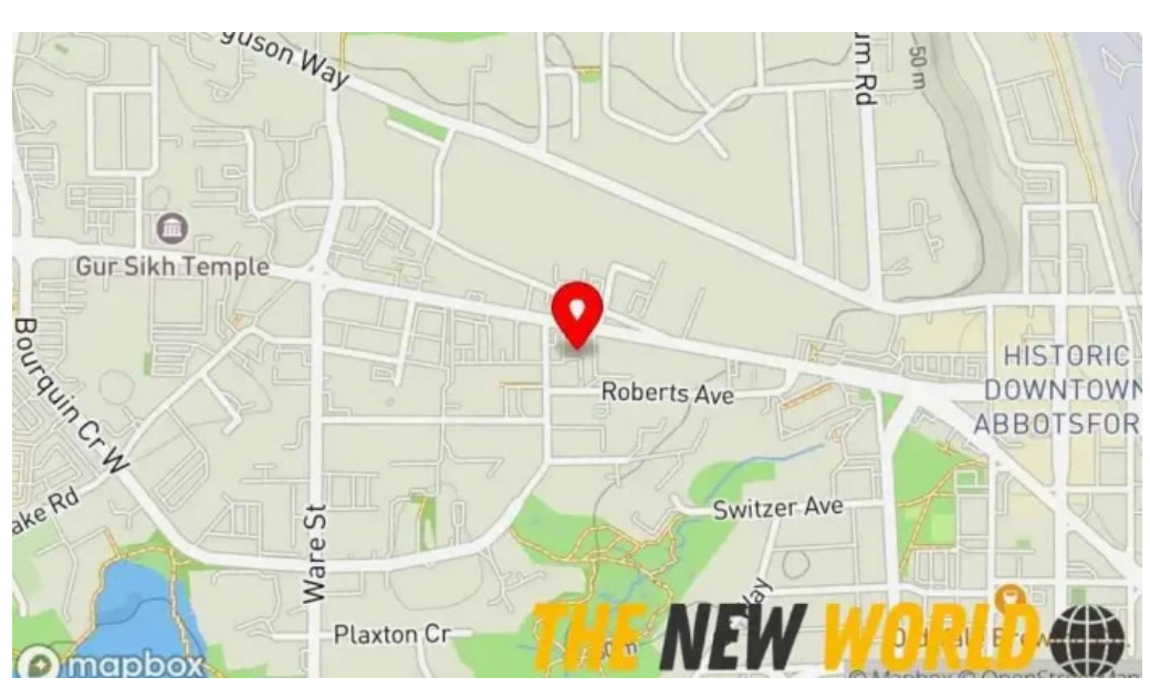
Assante capital management ltd map