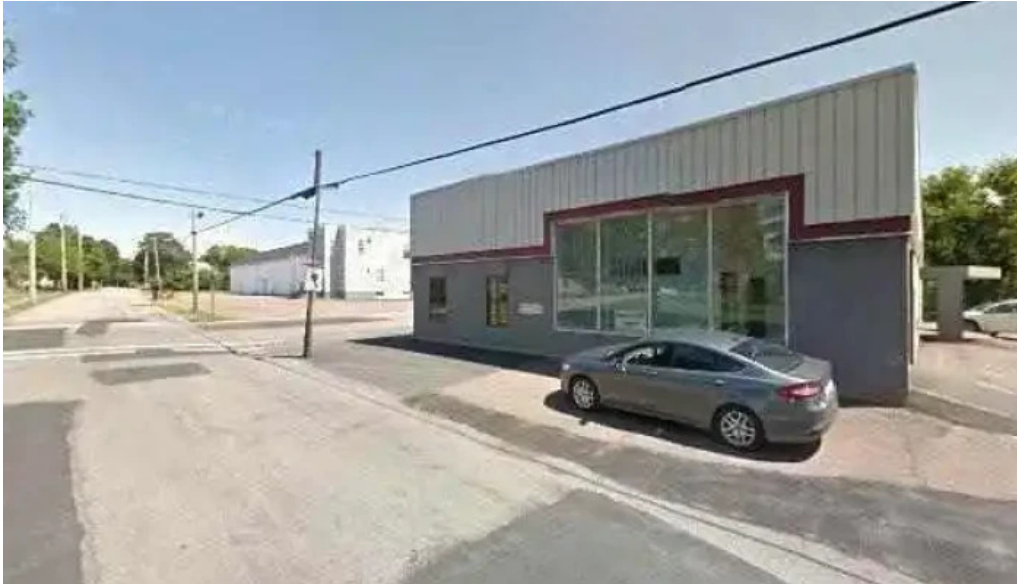
Von cumberland all