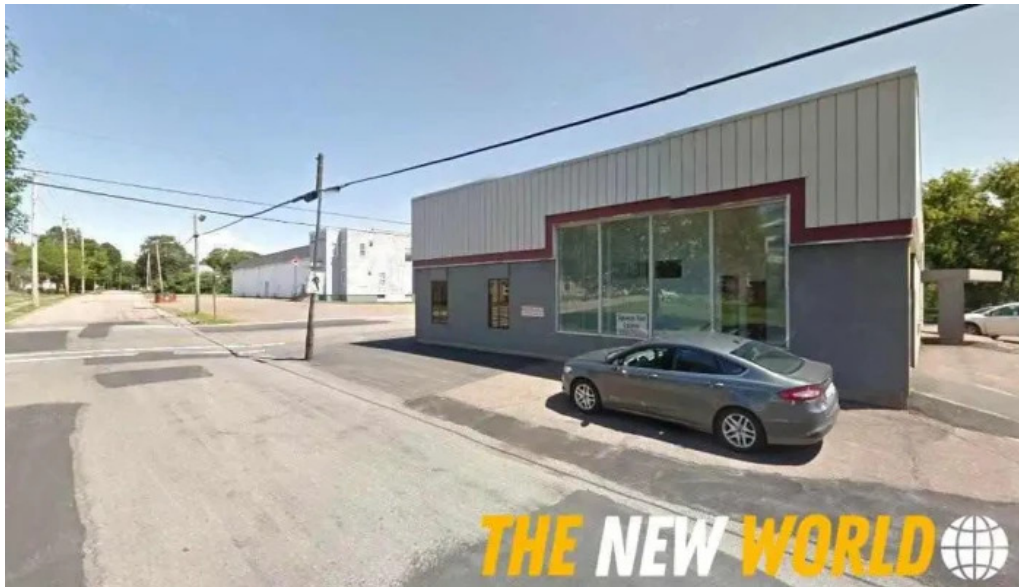
Von cumberland amherst