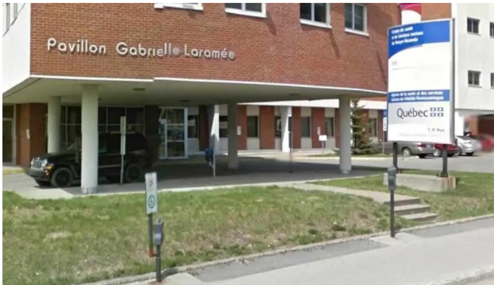
Center integrated health and social services de labitibi temiscamingue all