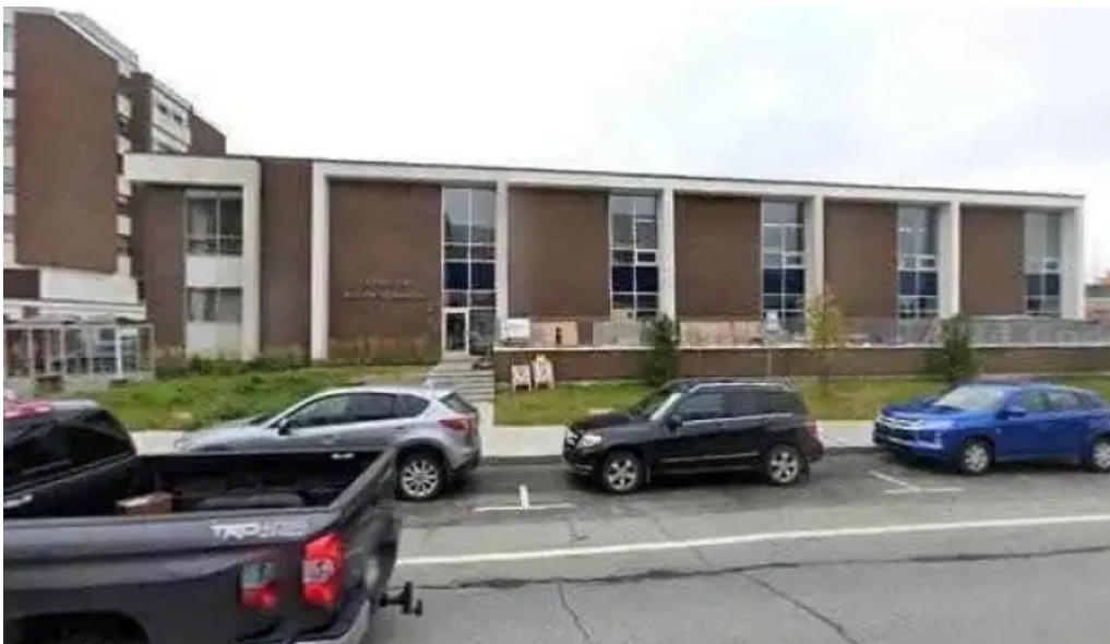
Center integrated health and social services de labitibi temiscamingue street view 360