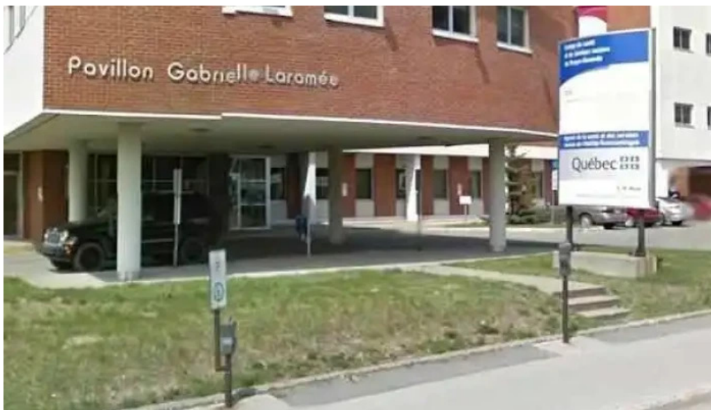
Center integrated health and social services de l abitibi temiscamingue rouyn noranda