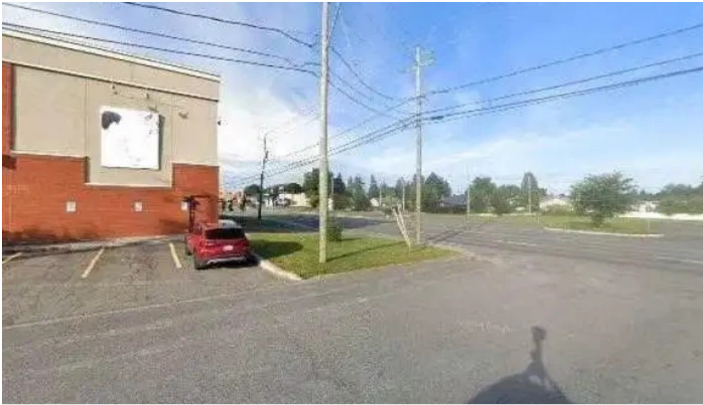
Tremblay cie ltee syndic autorise en insolvabilite street view 360deg