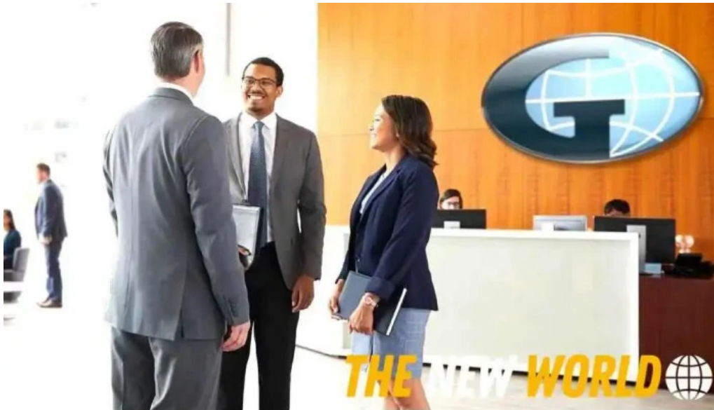
Gallagher insurance risk management consulting amherst