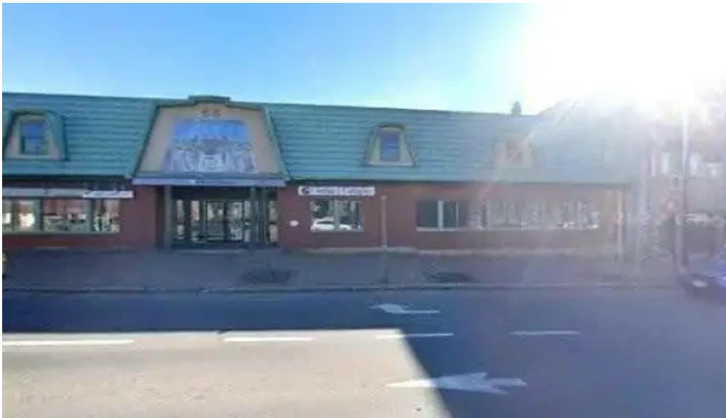
Gallagher insurance risk management consulting street view 360deg