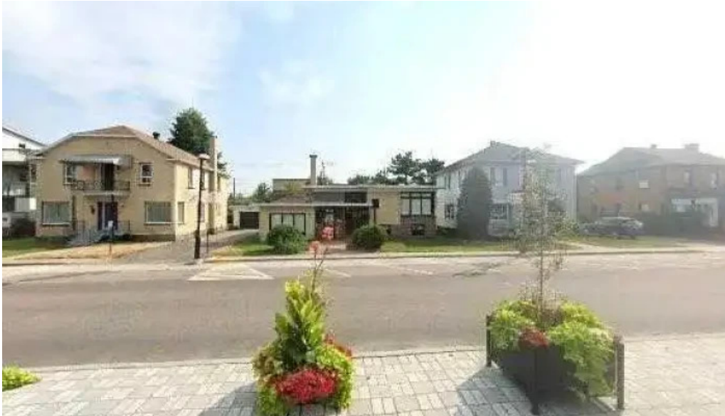
Boucher associes avocats all