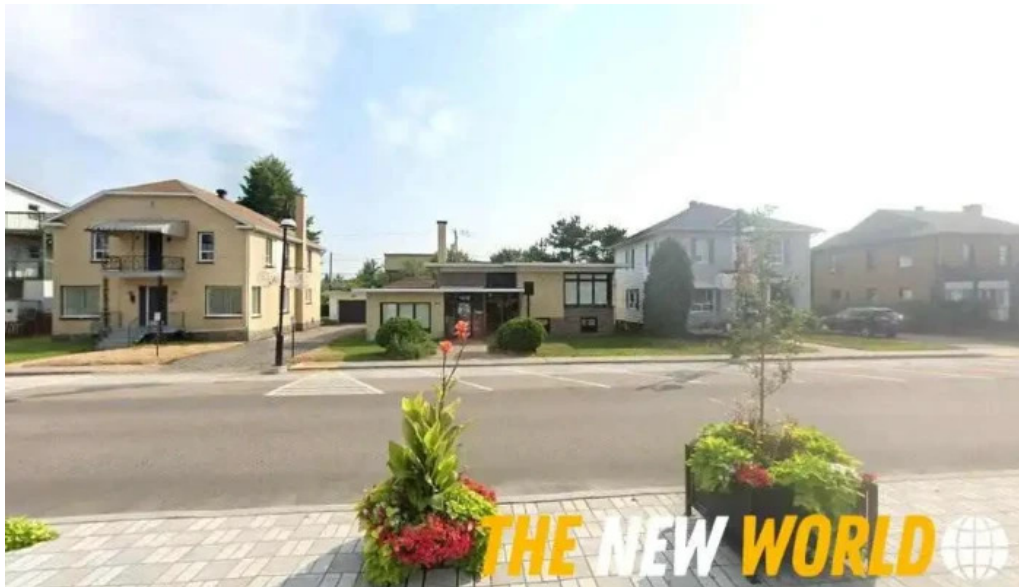
Boucher associes avocats dolbeau mistassini