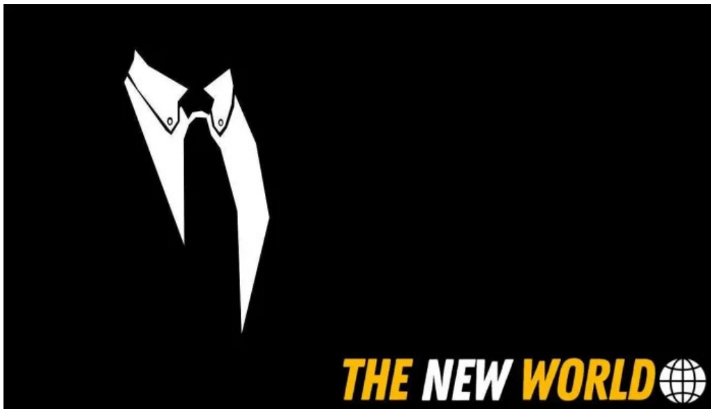
Boucher associes avocats by owner