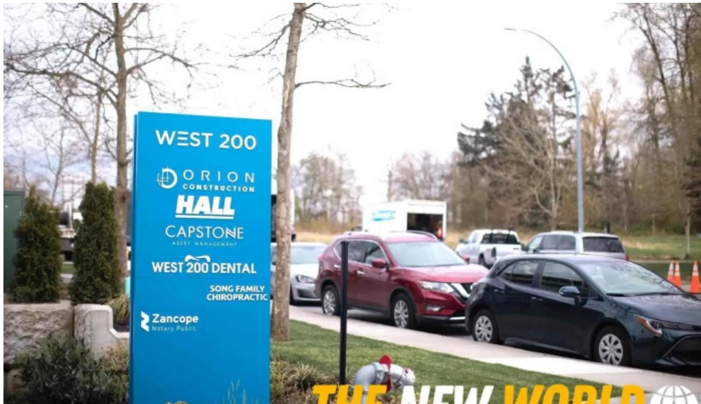
Zancope notary public all