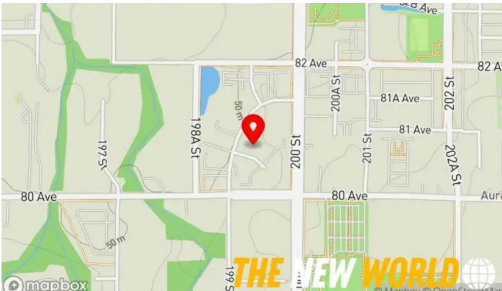
Zancope notary public map