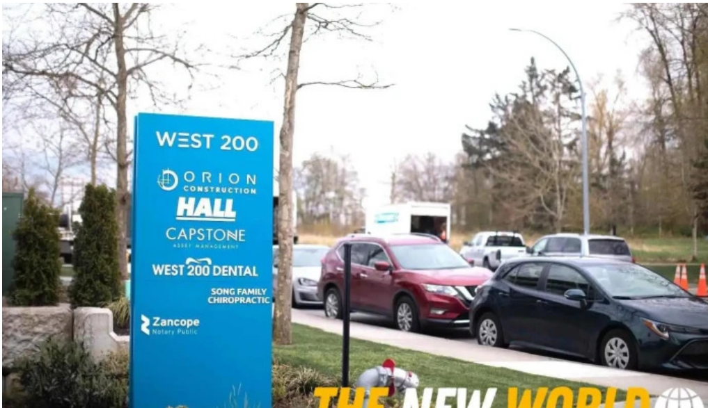
Zancope notary public langley twp