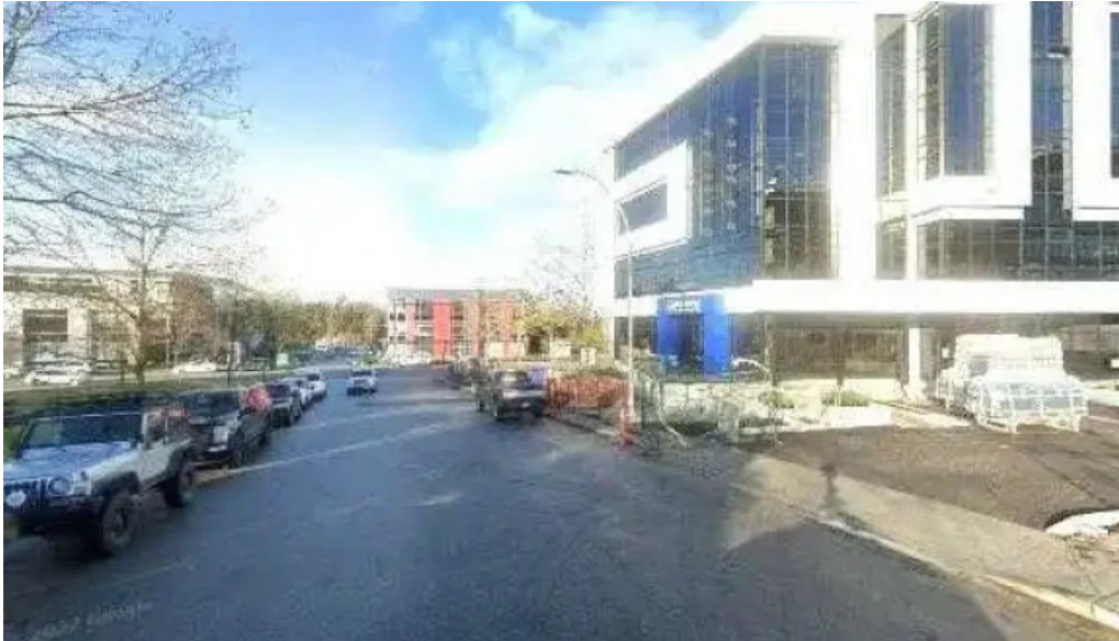
Zancope notary public street view 360deg