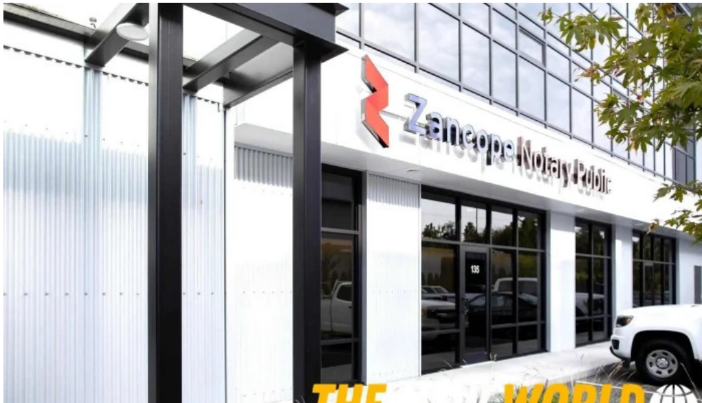
Zancope notary public exterior