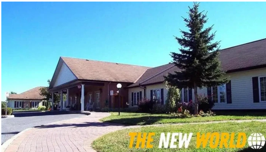
Levante arnprior villa all