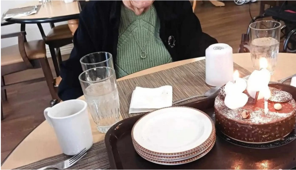
Levante arnprior villa from visitors