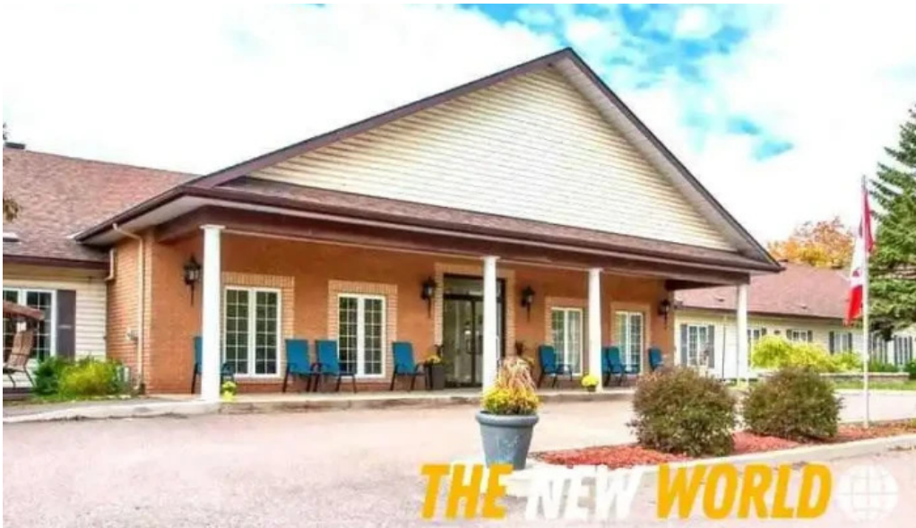
Levante arnprior villa exterior