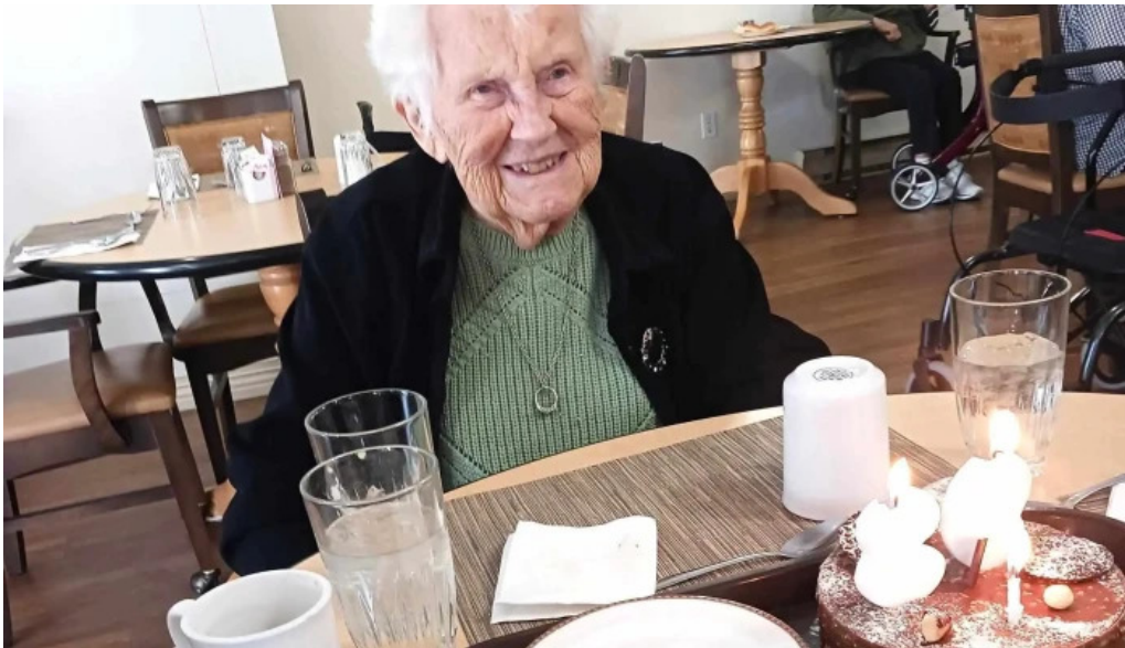
Levante arnprior villa retirement home