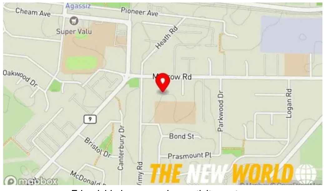
Friendship house seniors activity centre map