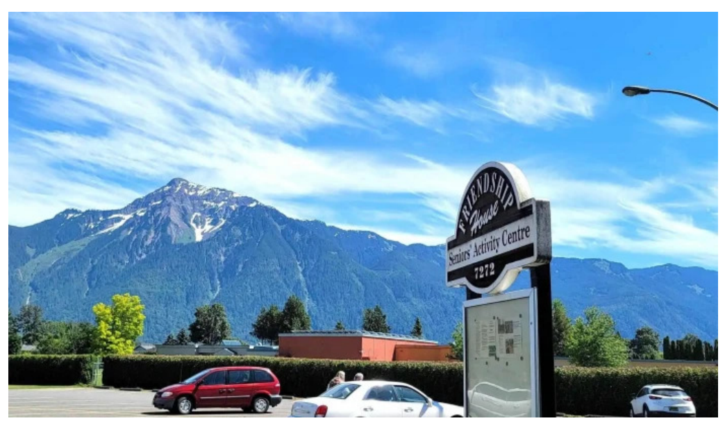
Friendship house seniors activity centre from visitors