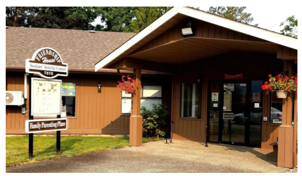
Friendship house seniors activity centre exterior