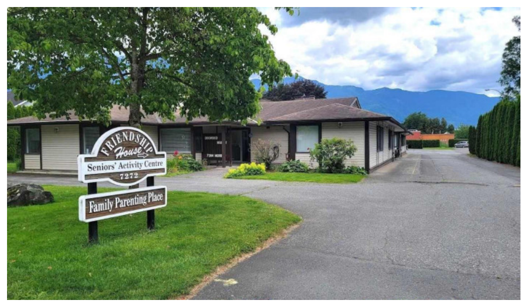
Friendship house seniors activity centre agassiz