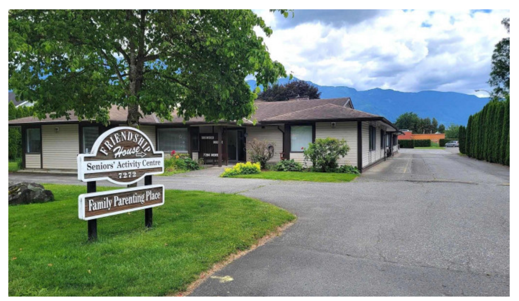
Friendship house seniors activity centre all