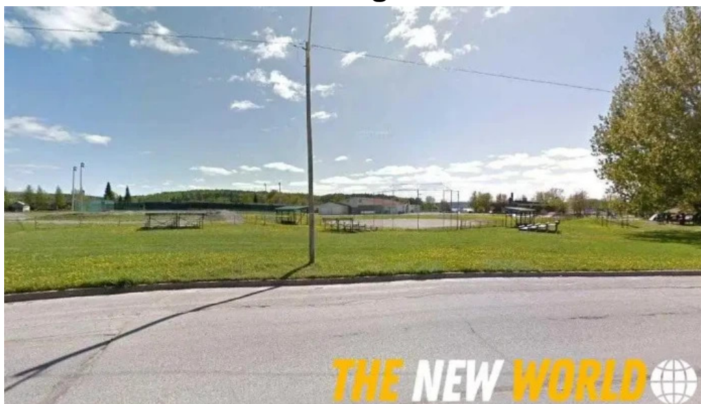
Alzheimer society sector temiscamingue ville marie