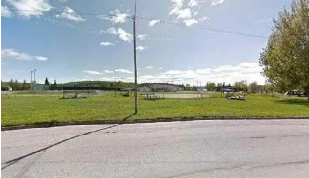
Alzheimer society sector temiscamingue all