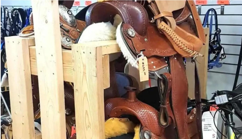
Maltby sports all