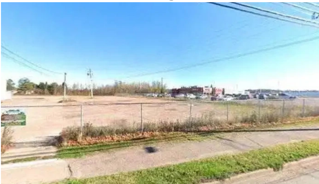
Maltby sports street view 360deg