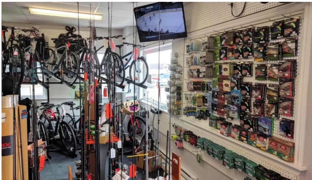
Maltby sports inside