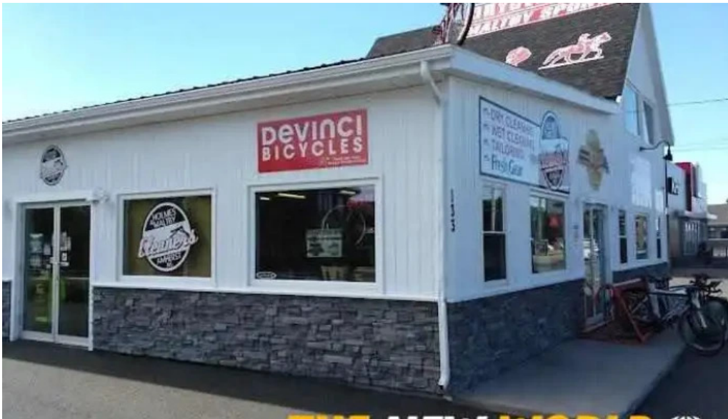
Maltby sports by owner