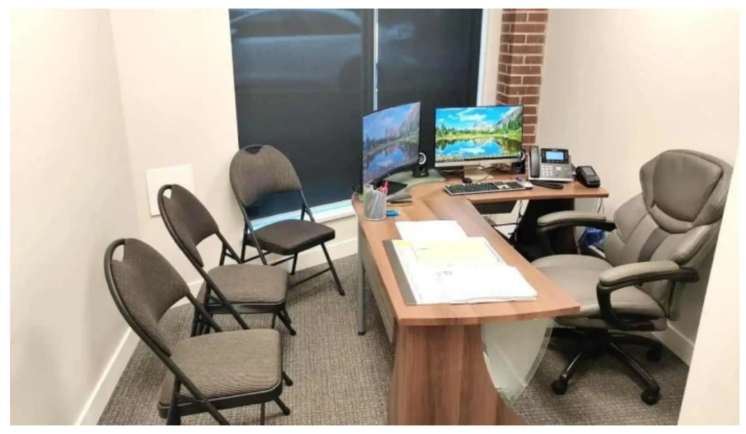
Abbotsford income tax abbotsford