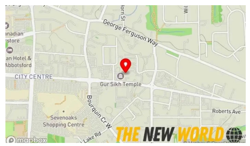
Abbotsford income tax map