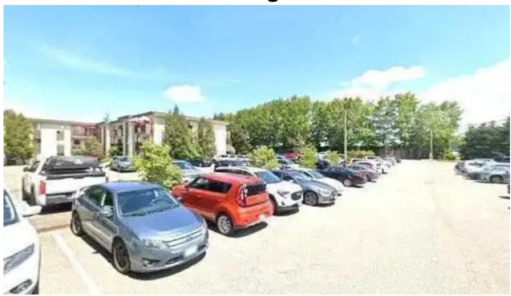
Abbotsford income tax street view 360