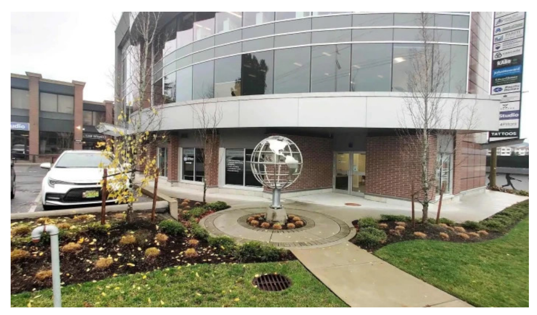
Abbotsford income tax by owner