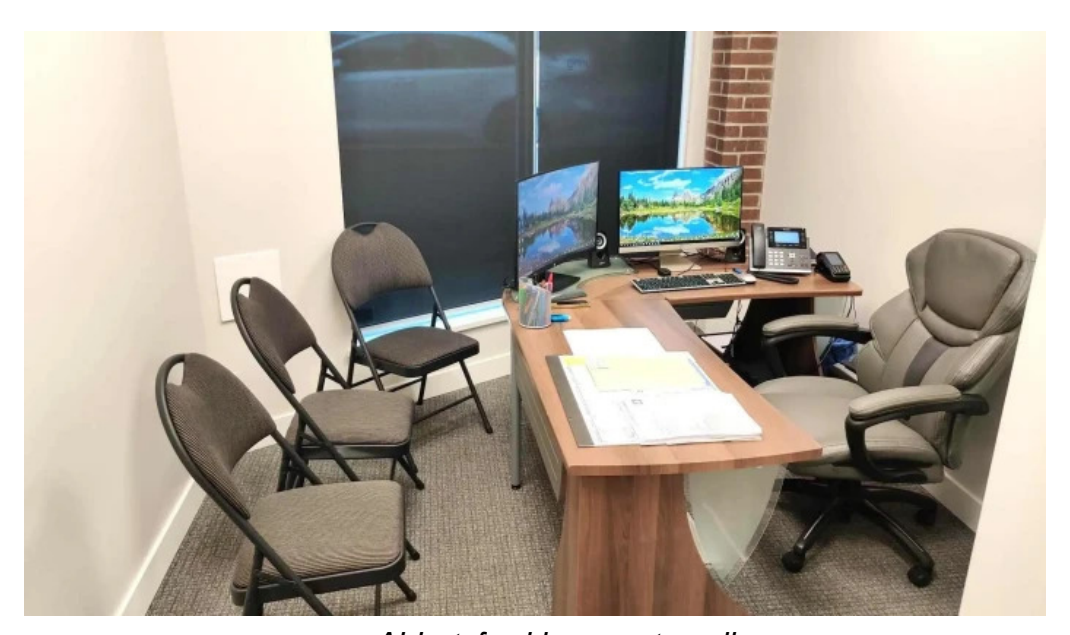
Abbotsford income tax all