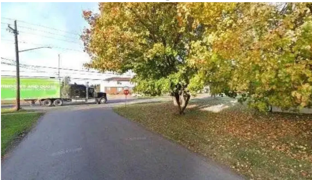
Hr block street view 360deg