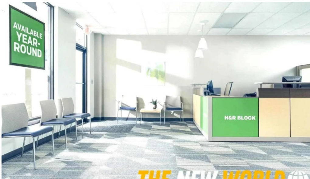
Hr block inside