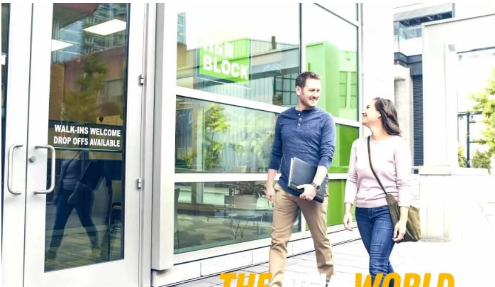
Hr block all