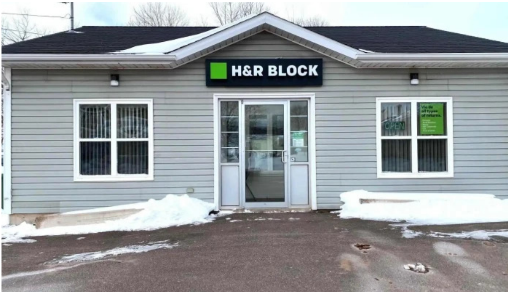
Hr block by owner