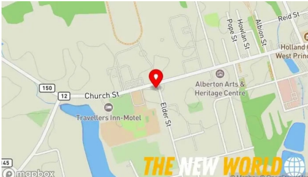
Hr block map