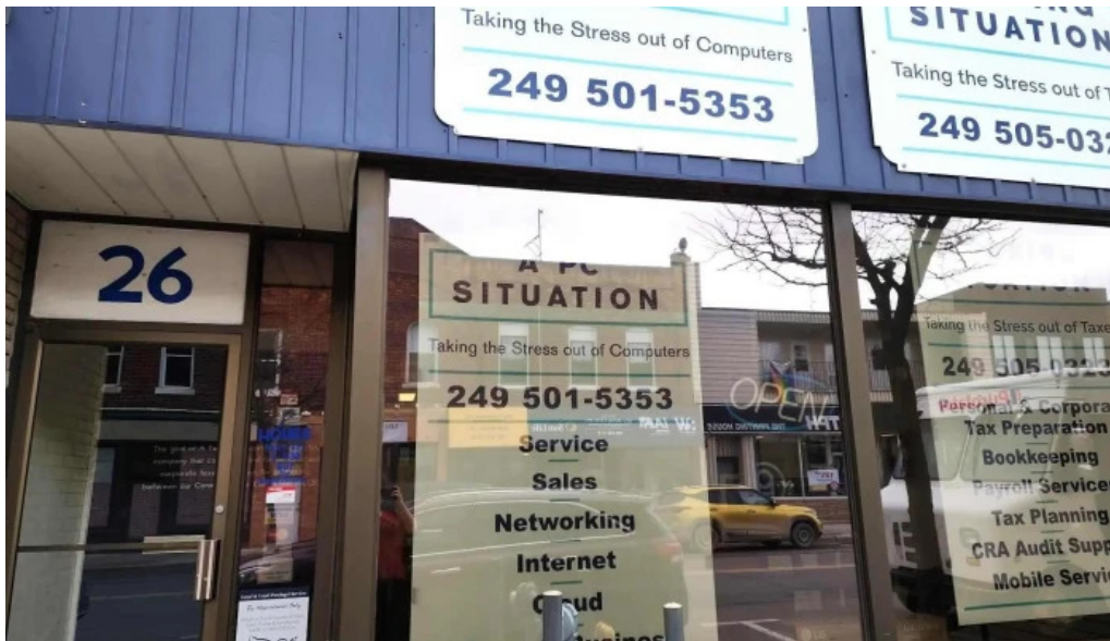
A taxing situation exterior