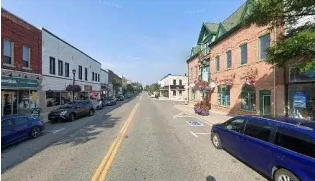
A taxing situation all