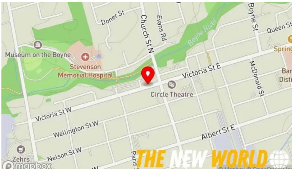
A taxing situation map